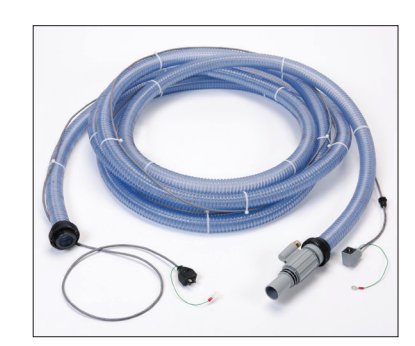
Adhesive transfer hoses available in a variety of lengths

For more information, speak with your Nordson representative or contact your Nordson regional office.