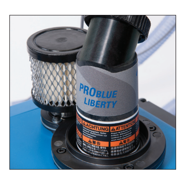
Adhesive inlet tube and air filter

Unit Dimensions (WxHxD) 539.1 x 485.9 x 371.9 mm 606.7 x 571.5 x 390.6 mm (21.22 x 19.13 x 14.64 in) (23.89 x 22.50 x 15.38 in)